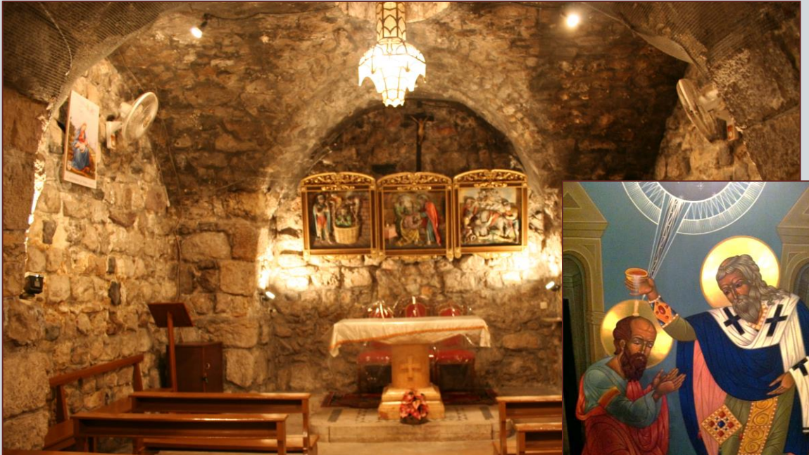
The house (now a chapel) of St. Ananias in Damascus, where he baptized the Apostle Paul (inset icon).

FEAST OF THE PROTECTION OF THE THEOTOKOS APOSTLE ANANIAS OF THE SEVENTY, FIRST BISHOP OF DAMASCUS RIGHTEOUS ROMANOS THE MELODIST • JOHN KOUKOUZELIS THE PSALTIS